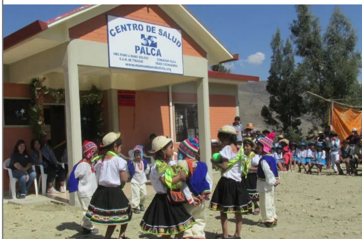
Dedicating a new clinic in Palca, Bolivia

Visit www.manoamano.org for more information.